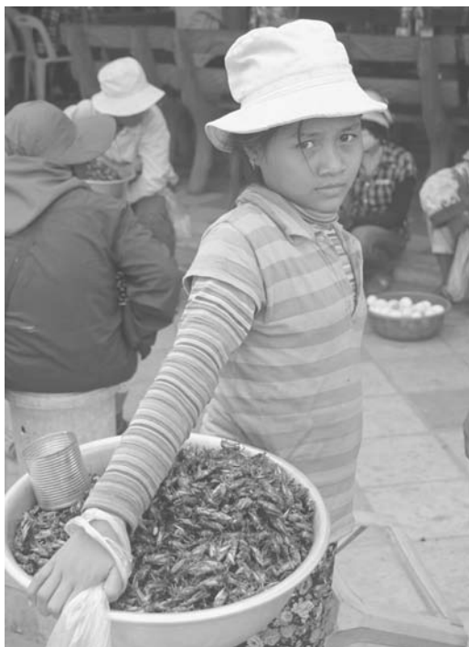
A young girl selling dried grasshoppers at Skun, between Phnom Penh and Kampong Cham, Cambodia.

The population of Cambodia is largely Khmer or descendants of the Khmer Empire. At its peak from the 10th to 13th centuries, the Khmer Empire ruled much of Southeast Asia, including the countries discussed in this section. Cambodia was also attacked by the Thai and Vietnamese before it was placed under French rule in 1887. After gaining independence from France in 1953, Cambodia was occupied by Japan and Vietnam, before it achieved its relative current stability. Burma was occupied by Britain from the 1820s to the 1880s and designated as part of India until